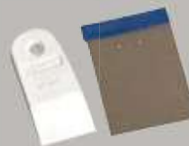
Rubber putty knife. Stripping knife