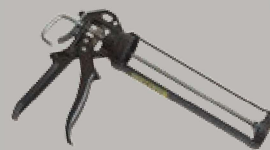
Adhesive applicator gun