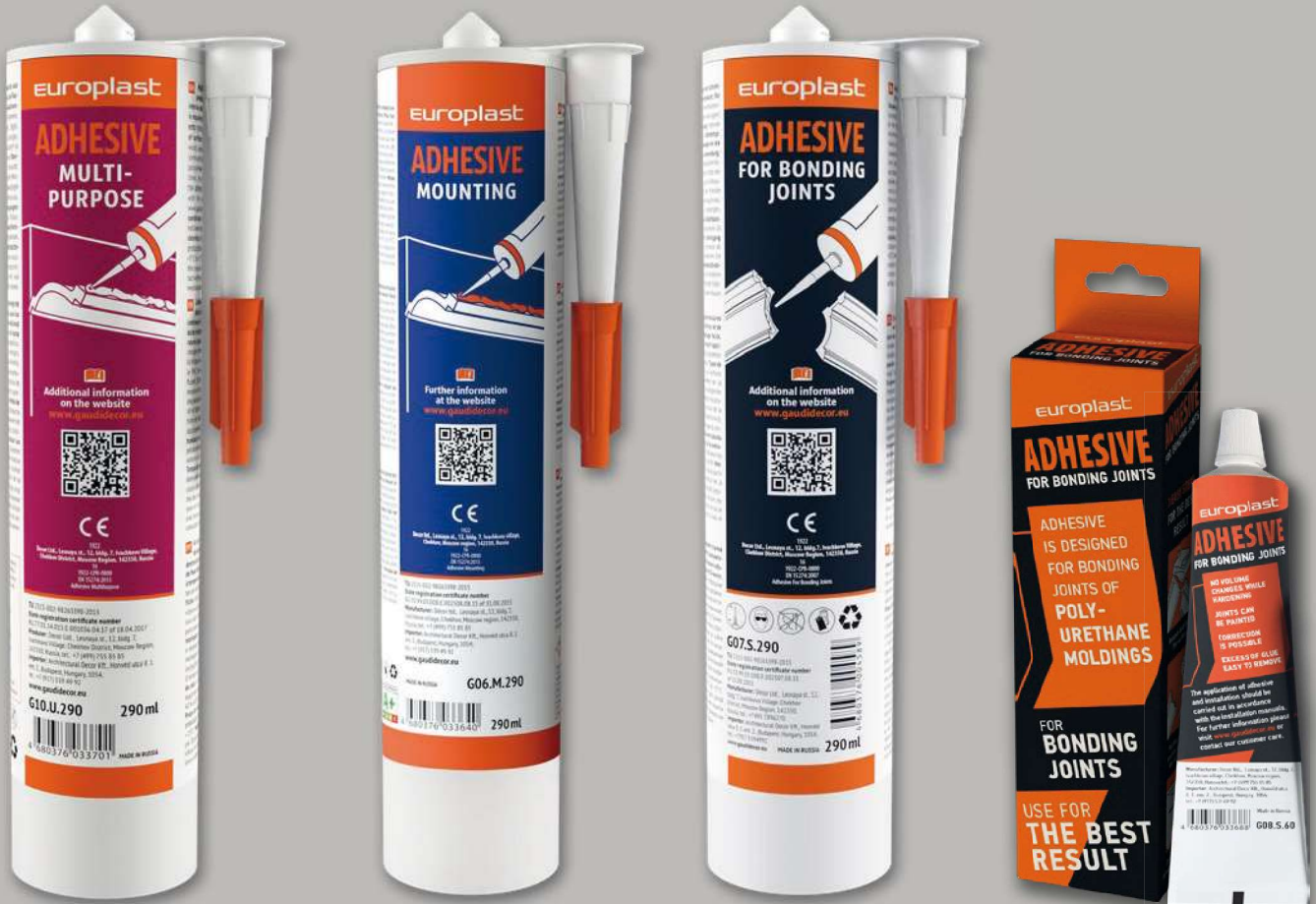
G10.U.290 290 ml