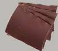
Fine grain abrasive paper