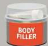
Fine grain water-soluble filler