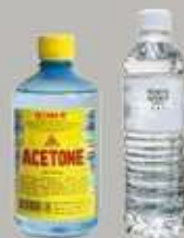
Acetone. White spirit