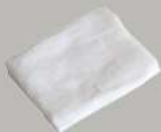
Cotton waste (Cloth)