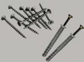
Self-tapping screw, dowel nail